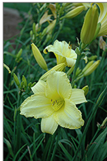
Happy Ever Appster Happy Returns Daylily flowers

Happy Ever Appster Happy Returns Daylily is recommended for the following landscape applications;