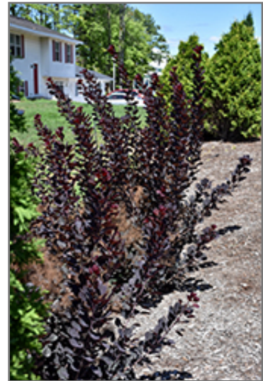
Winecraft Black Smokebush

This shrub should only be grown in full sunlight. It is very adaptable to both dry and moist locations, and should do just fine under average home landscape conditions. It is not particular as to soil type or pH. It is highly tolerant of urban pollution and will even thrive in inner city environments, and will benefit from being planted in a relatively sheltered location. This is a selected variety of a species not originally from North America.