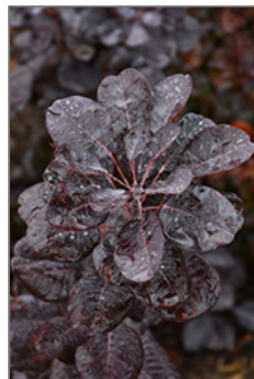
Winecraft Black Smokebush foliage