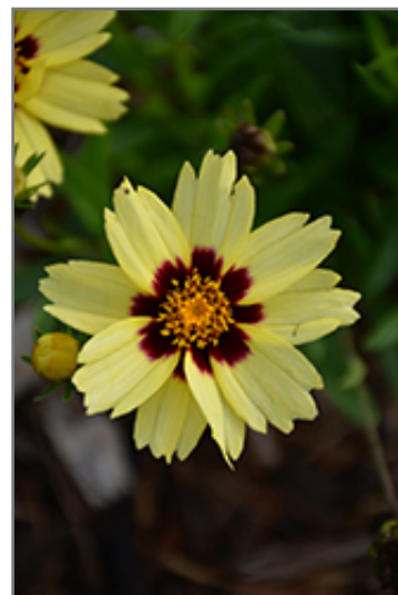
UpTick Cream and Red Tickseed flowers

UpTick Cream and Red Tickseed is recommended for the following landscape applications;