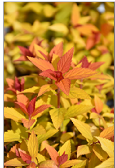
Double Play Candy Corn Spirea foliage

Double Play Candy Corn Spirea is recommended for the following landscape applications;