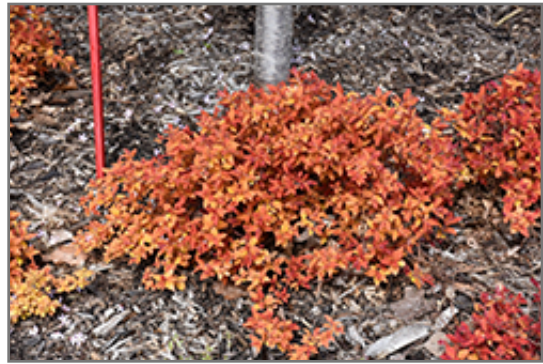
Double Play Candy Corn Spirea

This shrub should only be grown in full sunlight. It prefers to grow in average to moist conditions, and shouldn't be allowed to dry out. It is not particular as to soil type or pH. It is highly tolerant of urban pollution and will even thrive in inner city environments. This is a selected variety of a species not originally from North America.