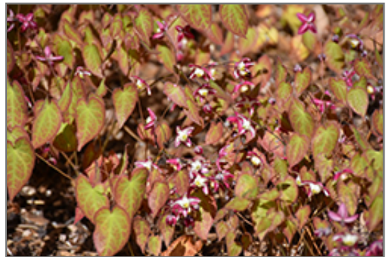
Bishop's Hat in bloom