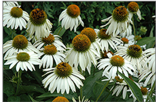
White Swan Coneflower flowers

White Swan Coneflower is recommended for the following landscape applications;