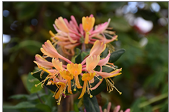
Goldflame Honeysuckle flowers