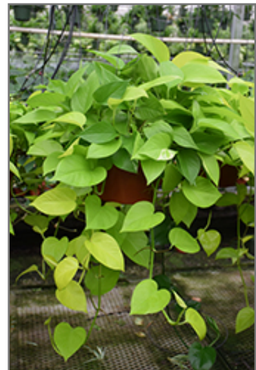
Neon Pothos in full

When grown indoors, Neon Pothos can be expected to grow to be about 5 feet tall at maturity, with a spread of 24 inches. It grows at a fast rate, and under ideal conditions can be expected to live for approximately 10 years. This houseplant performs well in both bright or indirect sunlight and strong artificial light, and can therefore be situated in almost any well-lit room or location. It does best in average to evenly moist soil, but will not tolerate standing water. The surface of the soil shouldn't be allowed to dry out completely, and so you should expect to water this plant once and possibly even twice each week. Be aware that your particular watering schedule may vary depending on its location in the room, the pot size, plant size and other conditions; if in doubt, ask one of our experts in the store for advice. It is not particular as to soil type or pH; an average potting soil should work just fine. Be warned that parts of this plant are known to be toxic to humans and animals, so special care should be exercised if growing it around children and pets.