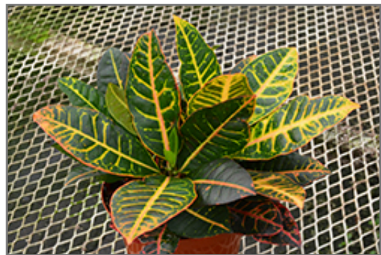
Petra Variegated Croton in full