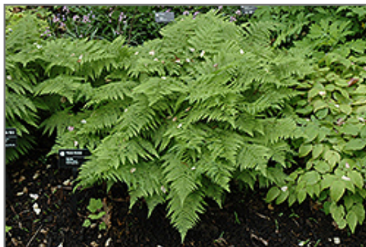
Lady Fern