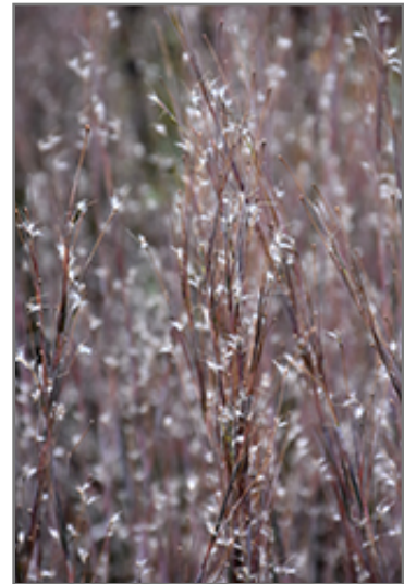
Standing Ovation Bluestem fruit

This plant should only be grown in full sunlight. It is very adaptable to both dry and moist locations, and should do just fine under typical garden conditions. It is considered to be drought-tolerant, and thus makes an ideal choice for a low-water garden or xeriscape application. It is not particular as to soil type or pH. It is somewhat tolerant of urban pollution. This is a selection of a native North American species. It can be propagated by division; however, as a cultivated variety, be aware that it may be subject to certain restrictions or prohibitions on propagation.