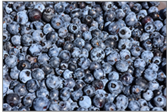
Lowbush Blueberry fruit

Lowbush Blueberry features dainty clusters of white bell-shaped flowers with shell pink overtones hanging below the branches in mid spring. It has dark green deciduous foliage. The oval leaves turn an outstanding scarlet in the fall. It features an abundance of magnificent blue berries in mid summer.