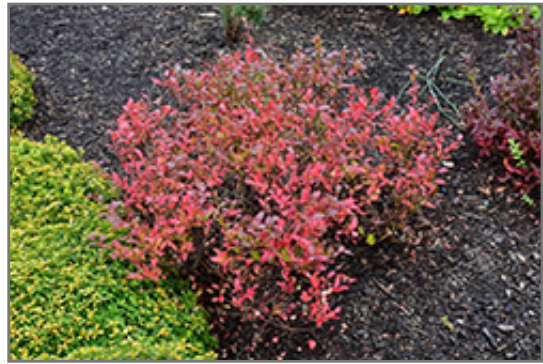
Lowbush Blueberry in fall

This shrub is typically grown in a designated area of the yard because of its mature size and spread. It performs well in both full sun and full shade. It does best in average to evenly moist conditions, but will not tolerate standing water. It is very fussy about its soil conditions and must have sandy, acidic soils to ensure success, and is subject to chlorosis (yellowing) of the foliage in alkaline soils. It is quite intolerant of urban pollution, therefore inner city or urban streetside plantings are best avoided, and will benefit from being planted in a relatively sheltered location. Consider applying a thick mulch around the root zone in winter to protect it in exposed locations or colder microclimates. This species is native to parts of North America.