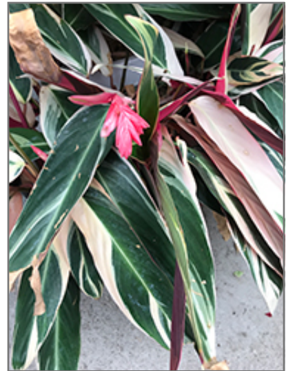
Tricolor Stromanthe flowers

Tricolor Stromanthe is a fine choice for the garden, but it is also a good selection for planting in outdoor pots and containers. With its upright habit of growth, it is best suited for use as a 'thriller' in the 'spiller-thriller-filler' container combination; plant it near the center of the pot, surrounded by smaller plants and those that spill over the edges. It is even sizeable enough that it can be grown alone in a suitable container. Note that when growing plants in outdoor containers and baskets, they may require more frequent waterings than they would in the yard or garden. Be aware that in our climate, this plant may be too tender to survive the winter if left outdoors in a container. Contact our experts for more information on how to protect it over the winter months.