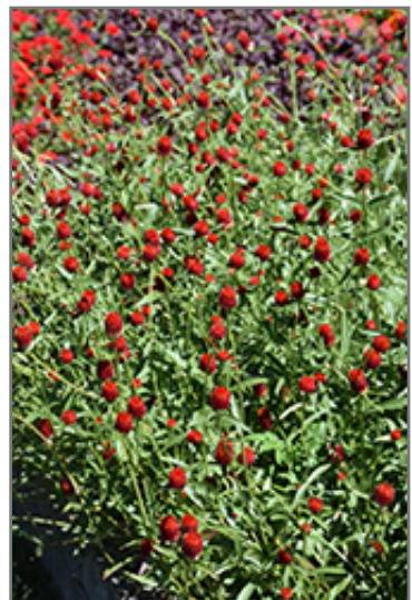
Qis Red Gomphrena flowers