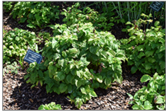
Raspberry Shortcake Raspberry

Raspberry Shortcake Raspberry is a good choice for the edible garden, but it is also well-suited for use in outdoor pots and containers. With its upright habit of growth, it is best suited for use as a 'thriller' in the 'spiller-thriller-filler' container combination; plant it near the center of the pot, surrounded by smaller plants and those that spill over the edges. It is even sizeable enough that it can be grown alone in a suitable container. Note that when grown in a container, it may not perform exactly as indicated on the tag - this is to be expected. Also note that when growing plants in outdoor containers and baskets, they may require more frequent waterings than they would in the yard or garden.