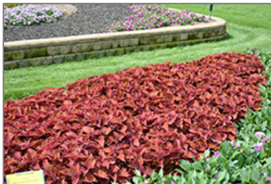
Wall Street Coleus