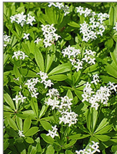
Sweet Woodruff flowers