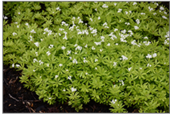
Sweet Woodruff in bloom

This plant does best in partial shade to shade. It prefers to grow in average to moist conditions, and shouldn't be allowed to dry out. It is not particular as to soil type, but has a definite preference for acidic soils. It is somewhat tolerant of urban pollution. This species is not originally from North America. It can be propagated by division.