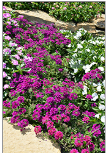
Superbena Royale Plum Wine Verbena in bloom