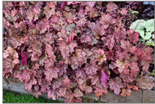
Carnival Watermelon Coral Bells in bloom

Carnival Watermelon Coral Bells will grow to be about 12 inches tall at maturity extending to 18 inches tall with the flowers, with a spread of 14 inches. When grown in masses or used as a bedding plant, individual plants should be spaced approximately 10 inches apart. Its foliage tends to remain dense right to the ground, not requiring facer plants in front. It grows at a medium rate, and under ideal conditions can be expected to live for approximately 10 years. As an evergreen perennial, this plant will typically keep its form and foliage year-round.