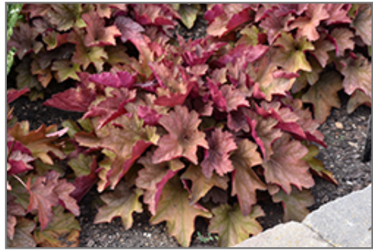
Carnival Watermelon Coral Bells

Carnival Watermelon Coral Bells is recommended for the following landscape applications;