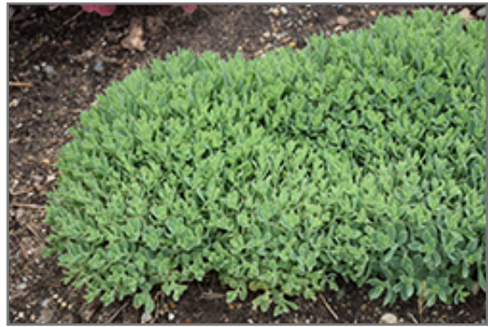
Rock 'N Round Pure Joy Stonecrop

Rock 'N Round Pure Joy Stonecrop is a fine choice for the garden, but it is also a good selection for planting in outdoor pots and containers. It is often used as a 'filler' in the 'spiller-thriller-filler' container combination, providing a mass of flowers and foliage against which the thriller plants stand out. Note that when growing plants in outdoor containers and baskets, they may require more frequent waterings than they would in the yard or garden.