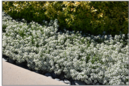
Snow Princess Alyssum in bloom

Snow Princess Alyssum will grow to be about 8 inches tall at maturity, with a spread of 24 inches. When grown in masses or used as a bedding plant, individual plants should be spaced approximately 20 inches apart. Its foliage tends to remain low and dense right to the ground. This fast-growing annual will normally live for one full growing season, needing replacement the following year.