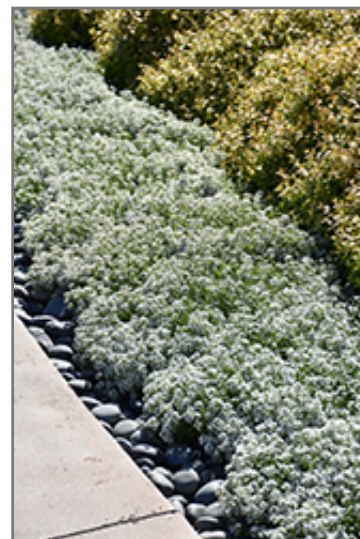
Snow Princess Alyssum in bloom

Snow Princess Alyssum is recommended for the following landscape applications;