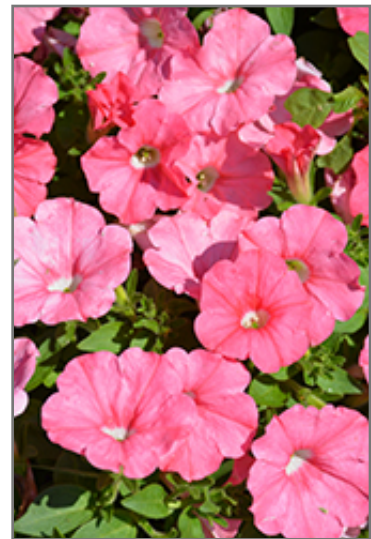
Supertunia Bermuda Beach Petunia flowers