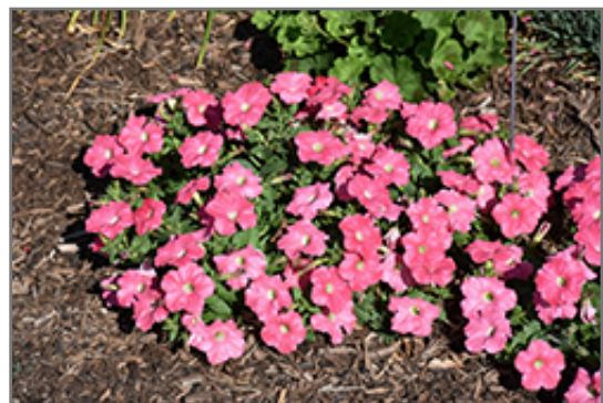
Supertunia Bermuda Beach Petunia in bloom