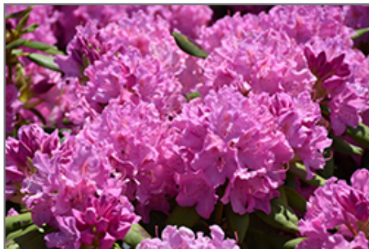
Roseum Elegans Rhododendron flowers