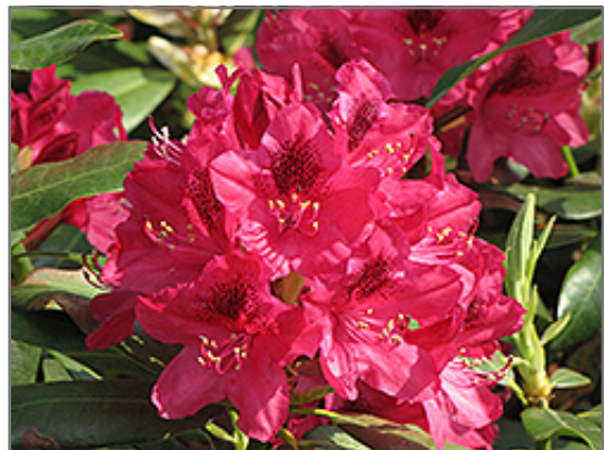
Nova Zembla Rhododendron flowers