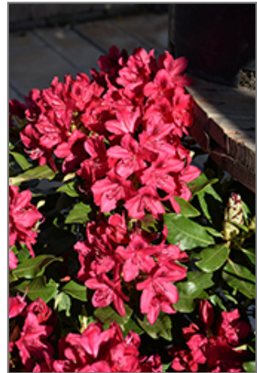
Nova Zembla Rhododendron flowers

This shrub does best in full sun to partial shade. You may want to keep it away from hot, dry locations that receive direct afternoon sun or which get reflected sunlight, such as against the south side of a white wall. It requires an evenly moist well-drained soil for optimal growth, but will die in standing water. It is very fussy about its soil conditions and must have rich, acidic soils to ensure success, and is subject to chlorosis (yellowing) of the foliage in alkaline soils. It is somewhat tolerant of urban pollution, and will benefit from being planted in a relatively sheltered location. Consider applying a thick mulch around the root zone in winter to protect it in exposed locations or colder microclimates. This particular variety is an interspecific hybrid.