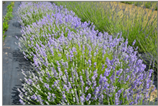
Blue Cushion Lavender in bloom

Blue Cushion Lavender will grow to be about 14 inches tall at maturity, with a spread of 16 inches. It tends to fill out right to the ground and therefore doesn't necessarily require facer plants in front. It grows at a slow rate, and under ideal conditions can be expected to live for approximately 10 years.