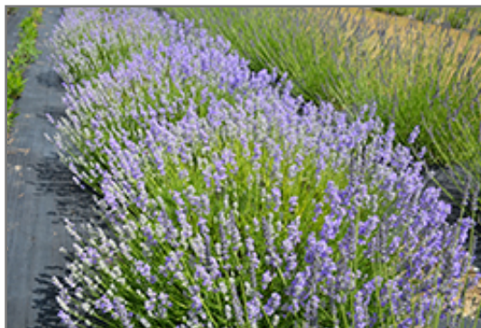
Blue Cushion Lavender in bloom