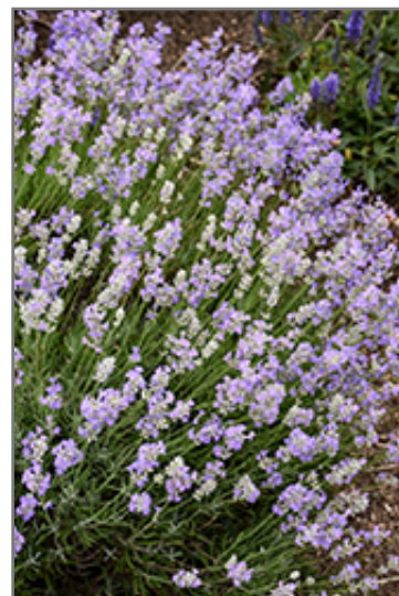
Blue Cushion Lavender flowers

This is a relatively low maintenance shrub, and can be pruned at anytime. It is a good choice for attracting bees and butterflies to your yard, but is not particularly attractive to deer who tend to leave it alone in favor of tastier treats. It has no significant negative characteristics.