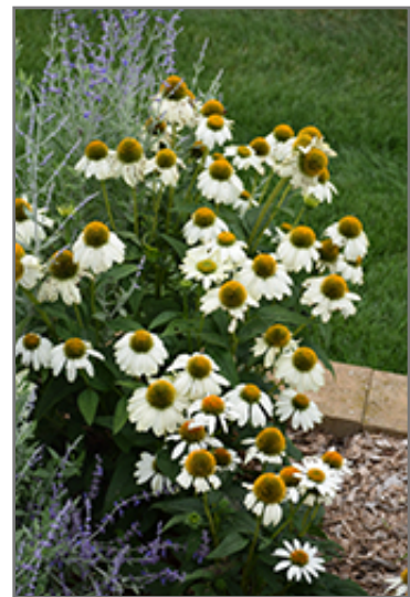
PowWow White Coneflower in bloom