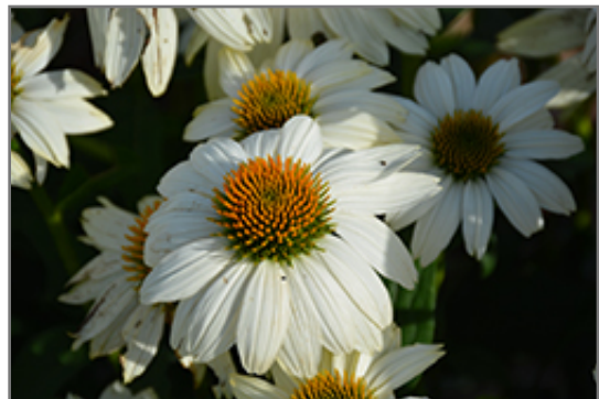
PowWow White Coneflower flowers

This is a relatively low maintenance plant, and is best cleaned up in early spring before it resumes active growth for the season. It is a good choice for attracting birds and butterflies to your yard, but is not particularly attractive to deer who tend to leave it alone in favor of tastier treats. It has no significant negative characteristics.