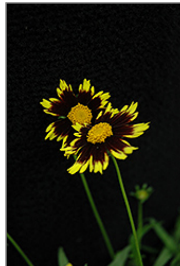
Cosmic Eye Tickseed flowers

Cosmic Eye Tickseed is recommended for the following landscape applications;