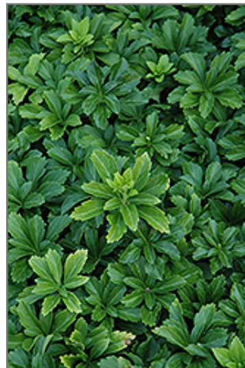
Green Sheen Japanese Spurge foliage