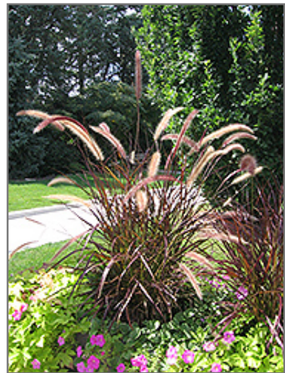
Purple Fountain Grass flowers

Purple Fountain Grass is recommended for the following landscape applications;