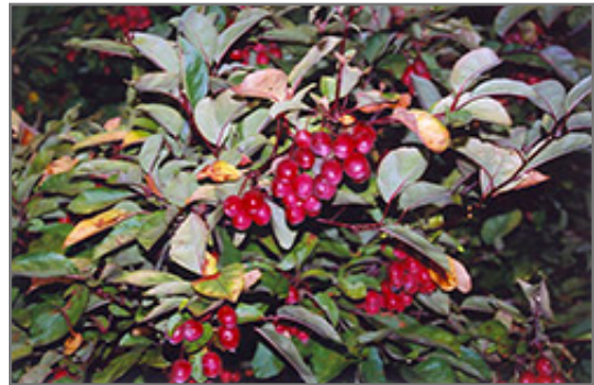
Adams Flowering Crab fruit

This tree should only be grown in full sunlight. It prefers to grow in average to moist conditions, and shouldn't be allowed to dry out. It is not particular as to soil type or pH. It is highly tolerant of urban pollution and will even thrive in inner city environments. This particular variety is an interspecific hybrid.