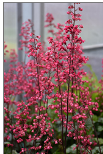
Paris Coral Bells flowers