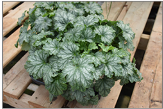
Paris Coral Bells foliage

Paris Coral Bells will grow to be about 8 inches tall at maturity extending to 14 inches tall with the flowers, with a spread of 14 inches. When grown in masses or used as a bedding plant, individual plants should be spaced approximately 12 inches apart. Its foliage tends to remain low and dense right to the ground. It grows at a medium rate, and under ideal conditions can be expected to live for approximately 10 years. As an evergreen perennial, this plant will typically keep its form and foliage year-round.