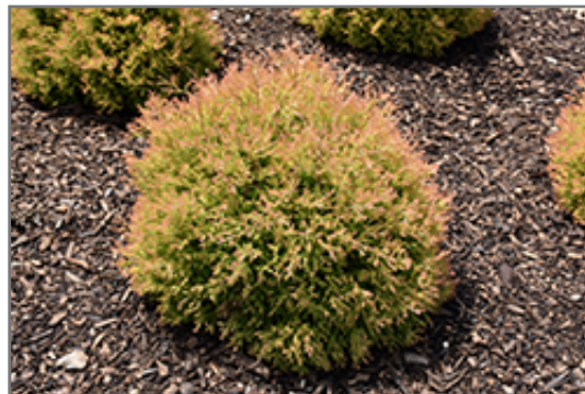
Fire Chief Arborvitae

Fire Chief Arborvitae is recommended for the following landscape applications;