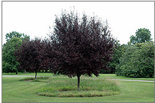
Krauter Vesuvius Plum

This tree should only be grown in full sunlight. It does best in average to evenly moist conditions, but will not tolerate standing water. It is not particular as to soil type or pH. It is highly tolerant of urban pollution and will even thrive in inner city environments. This is a selected variety of a species not originally from North America.