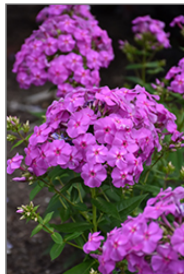
Flame Lilac Garden Phlox flowers

Flame Lilac Garden Phlox is recommended for the following landscape applications;