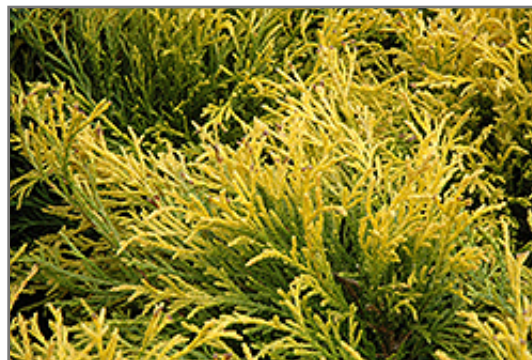
Golden Mop Falsecypress foliage