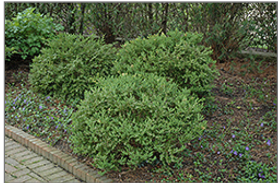
Wintergreen Boxwood