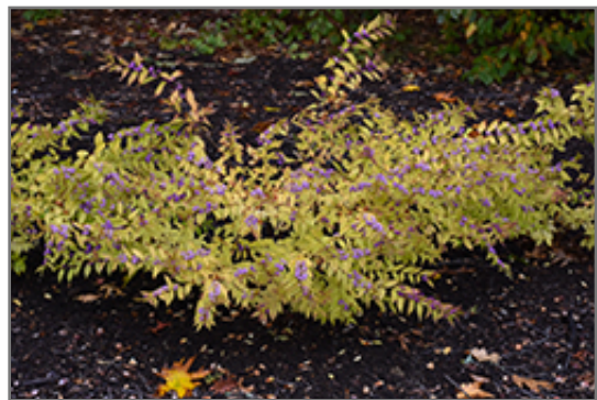
Early Amethyst Beautyberry fruit