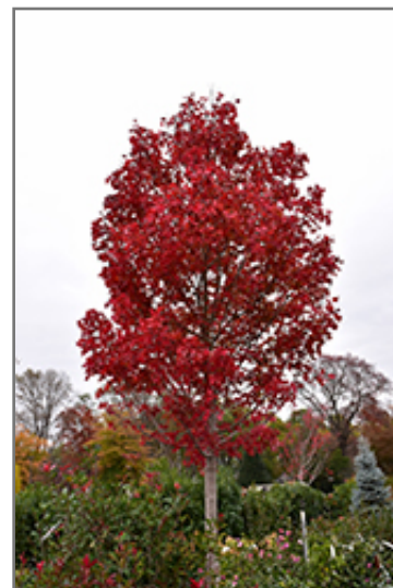
October Glory Red Maple in fall