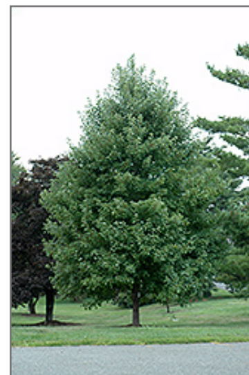
October Glory Red Maple