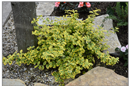
Gold Splash Wintercreeper