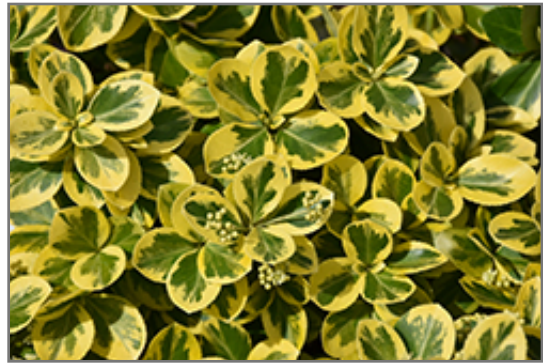
Gold Splash Wintercreeper flower buds

This shrub performs well in both full sun and full shade. It is very adaptable to both dry and moist locations, and should do just fine under typical garden conditions. It is not particular as to soil type or pH. It is highly tolerant of urban pollution and will even thrive in inner city environments, and will benefit from being planted in a relatively sheltered location. This is a selected variety of a species not originally from North America.