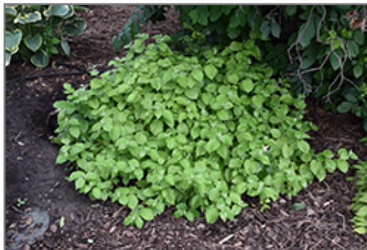
Arctic Sun Dogwood