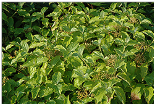
Arctic Sun Dogwood foliage