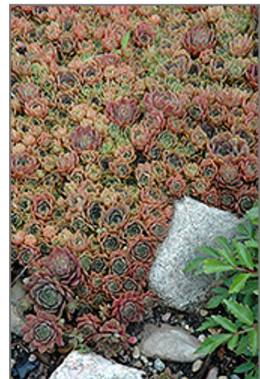
Silverine Hens And Chicks