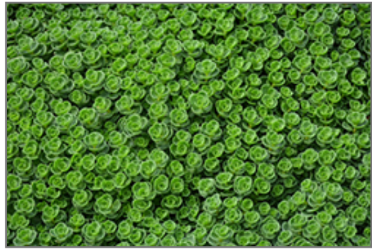
John Creech Stonecrop foliage

John Creech Stonecrop will grow to be only 3 inches tall at maturity, with a spread of 12 inches. When grown in masses or used as a bedding plant, individual plants should be spaced approximately 10 inches apart. Its foliage tends to remain low and dense right to the ground. It grows at a fast rate, and under ideal conditions can be expected to live for approximately 10 years. As an herbaceous perennial, this plant will usually die back to the crown each winter, and will regrow from the base each spring. Be careful not to disturb the crown in late winter when it may not be readily seen!