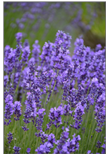
Hidcote Lavender flowers