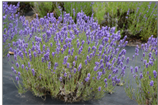
Hidcote Lavender in bloom