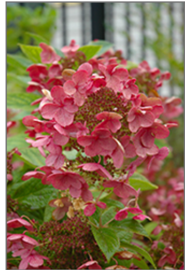
Quick Fire Hydrangea flowers (faded)

This shrub performs well in both full sun and full shade. It prefers to grow in average to moist conditions, and shouldn't be allowed to dry out. It is not particular as to soil type or pH. It is highly tolerant of urban pollution and will even thrive in inner city environments. Consider applying a thick mulch around the root zone in winter to protect it in exposed locations or colder microclimates. This is a selected variety of a species not originally from North America.