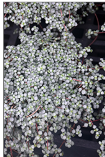
Aquamarine Pilea foliage