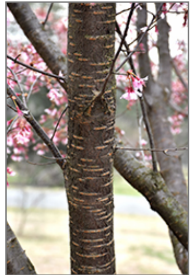
Autumnalis Higan Cherry bark

This tree should only be grown in full sunlight. It does best in average to evenly moist conditions, but will not tolerate standing water. It is not particular as to soil pH, but grows best in rich soils. It is highly tolerant of urban pollution and will even thrive in inner city environments, and will benefit from being planted in a relatively sheltered location. This is a selected variety of a species not originally from North America.