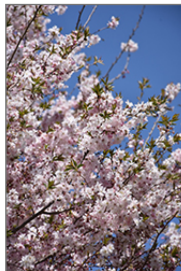
Autumnalis Higan Cherry flowers