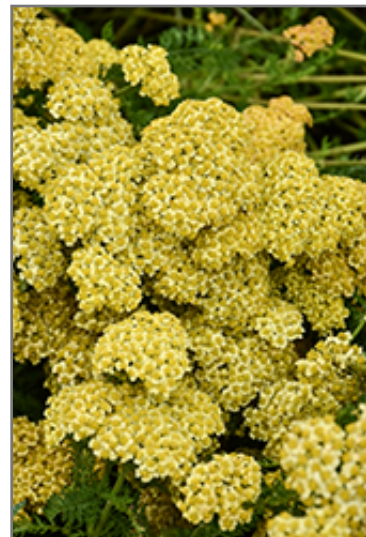
Milly Rock Yellow Terracotta Yarrow flowers