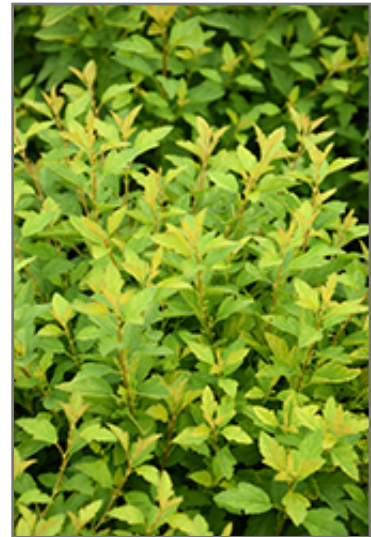
Raspberry Lemonade Ninebark foliage

Raspberry Lemonade Ninebark is recommended for the following landscape applications;