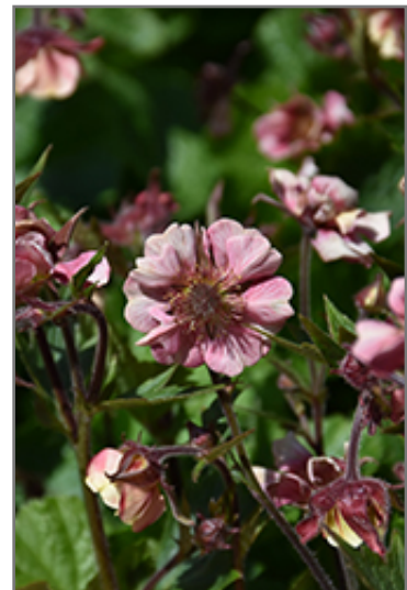
Tempo Rose Avens flowers

Tempo Rose Avens is recommended for the following landscape applications;