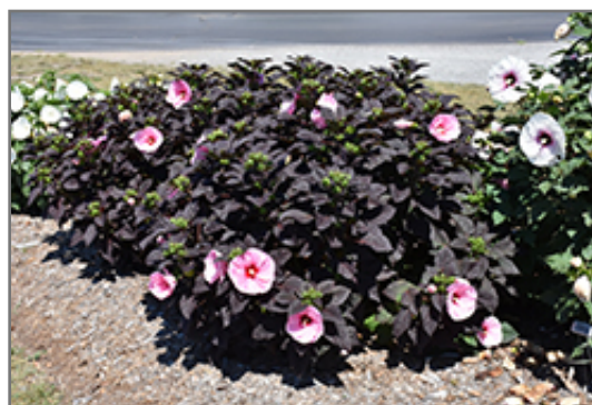
Summerific Edge of Night Hibiscus in bloom